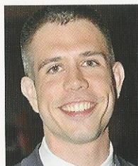
STEPHEN KARAM (Playwright)