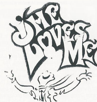
Official artwork from BBC production

I hope you enjoy, and maybe after you get home tonight, sit down and write someone you love a letter. It'll do you some good.