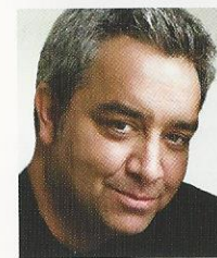
STEPHEN ADLY GUIRGIS