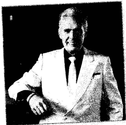
Bill Conti, conductor

Oscar® and five-time Emmy® Award-winner Bill Conti is one of Hollywood's most respected composers and conductors for both film and television. His compositions have sold in excess of eight million albums, and he is in great demand as a conductor of symphony orchestras throughout the United States. For the silver screen, Bill Conti has composed the musical scores for many box office giants including Broadcast News , The Karate Kid and Private Benjamin . He won an Oscar® for Best Original Score for The Right Stuff in 1983 and received two Oscar® nominations for Best Original Song—one for the Sheena Easton hit record "For Your Eyes Only" from the James Bond picture of the same title and one for "Gonna Fly Now," the powerful anthem from the 1976 Academy Award-winning Best Picture, Rocky .