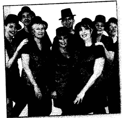
Tap Fever Studios

This performance marks his fourth time performing with the San Diego Symphony. 📷